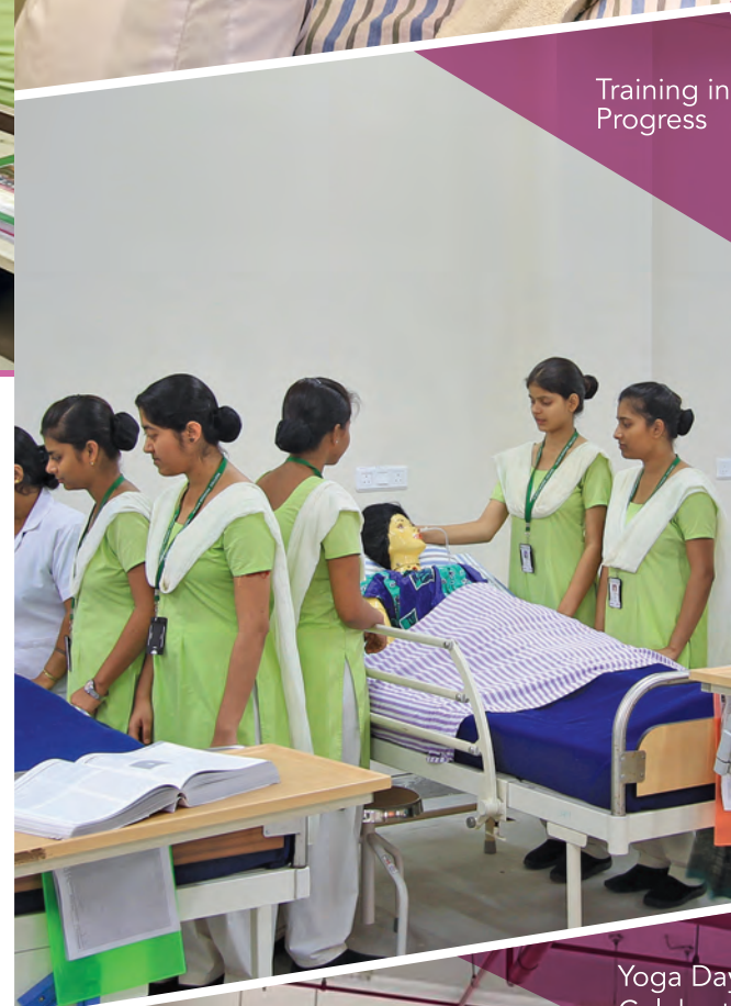
Training in Progress

ALL-ROUNDERS AT IQ CITY INSTITUTE OF NURSING SCIENCES