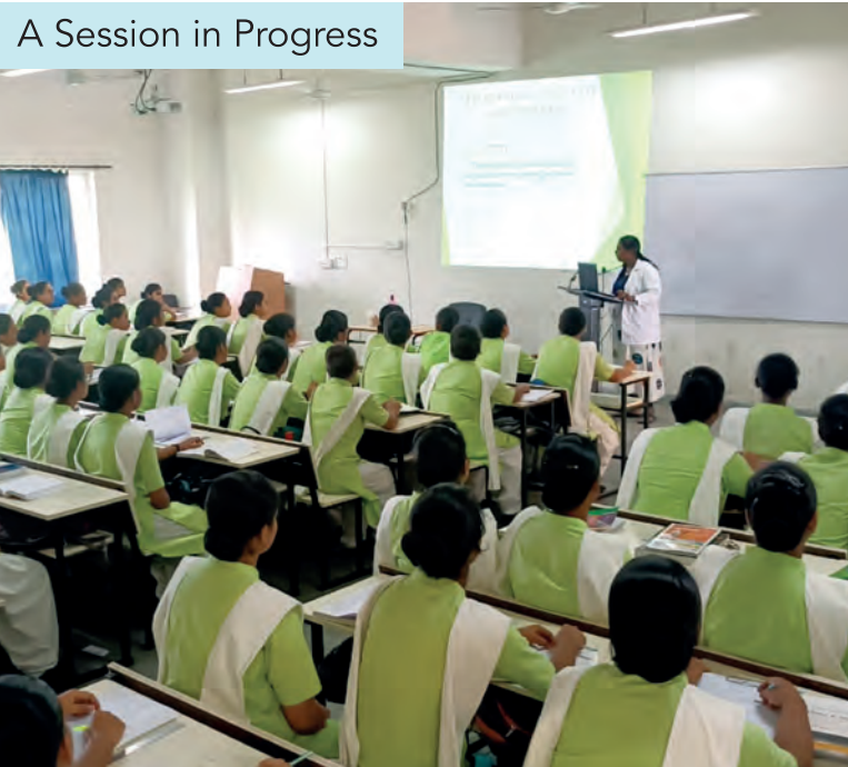
A Session in Progress