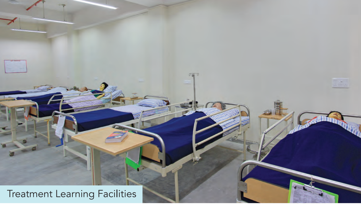
Treatment Learning Facilities