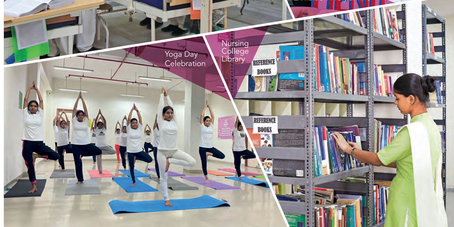
Yoga Day Celebration