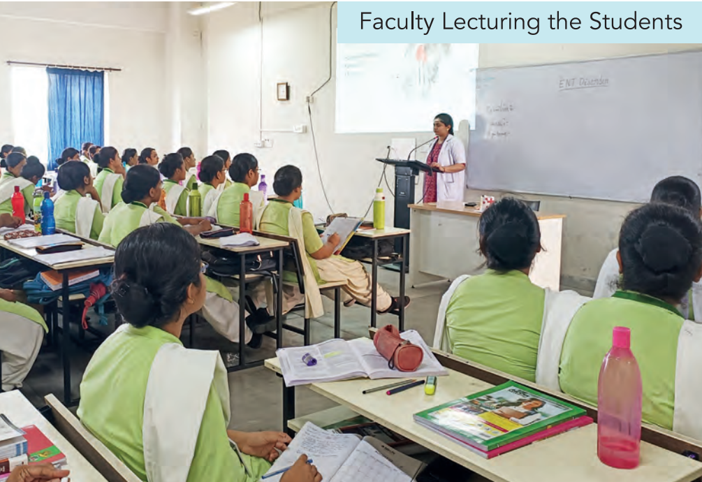
Faculty Lecturing the Students