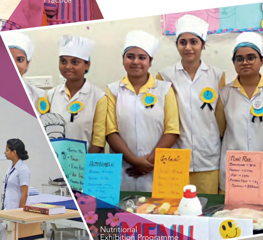
Nutritional Exhibition Programme