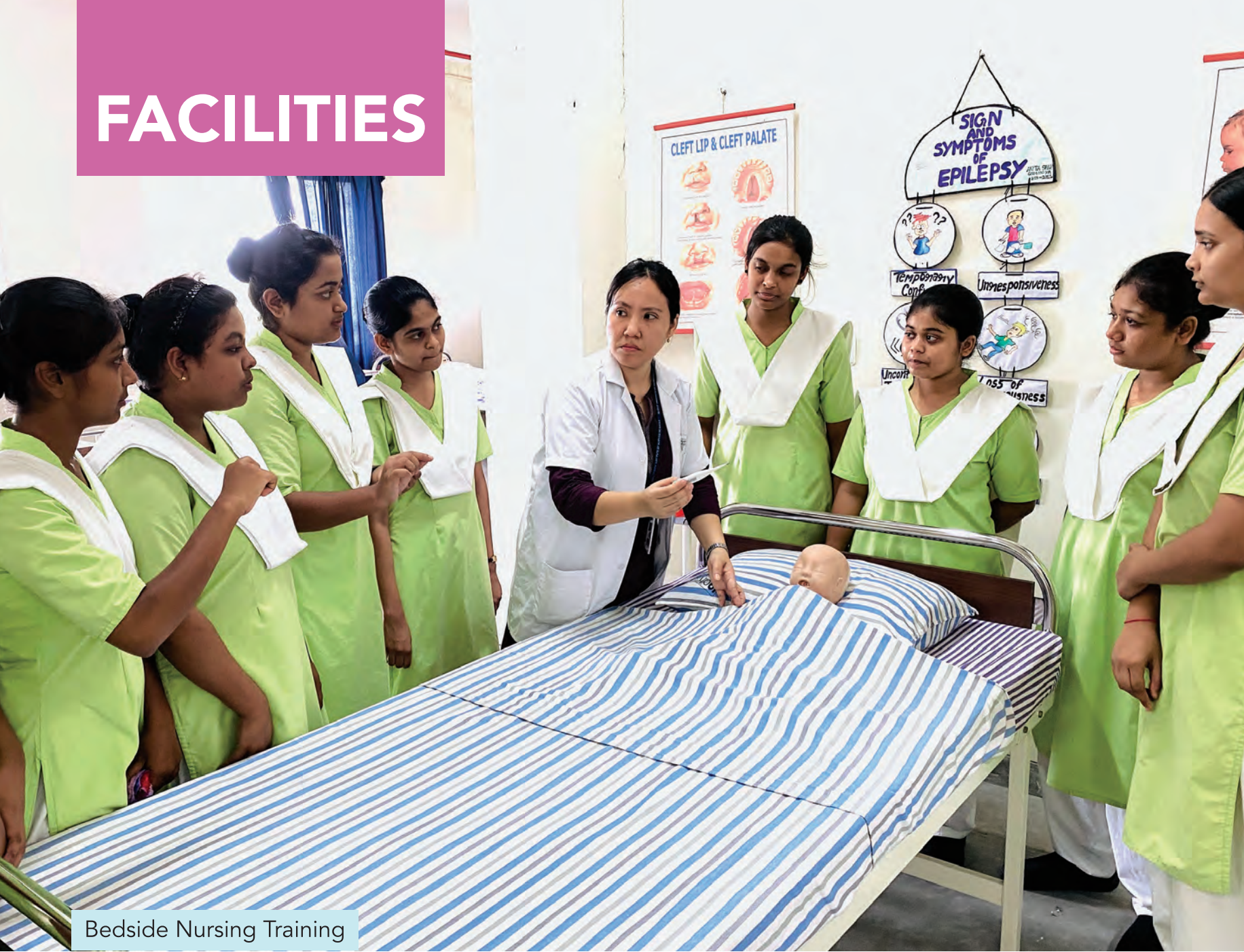
Bedside Nursing Training